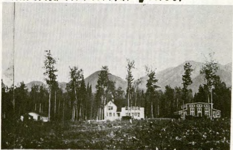
Office + Res.