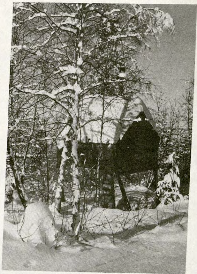
An abandoned cache at Eklutna (February, 1979.)