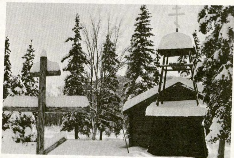
Saint Nicholas Church (February, 1979).