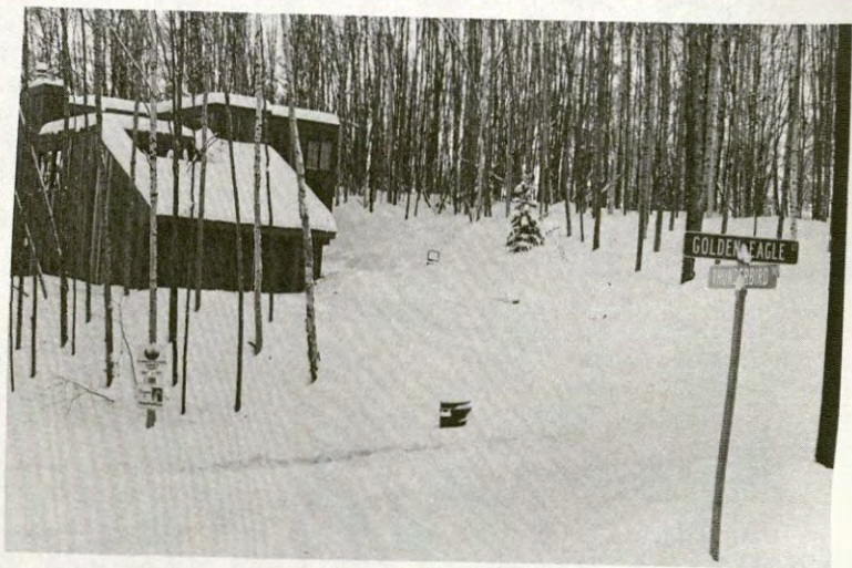
Thunderbird Heights (February, 1979).