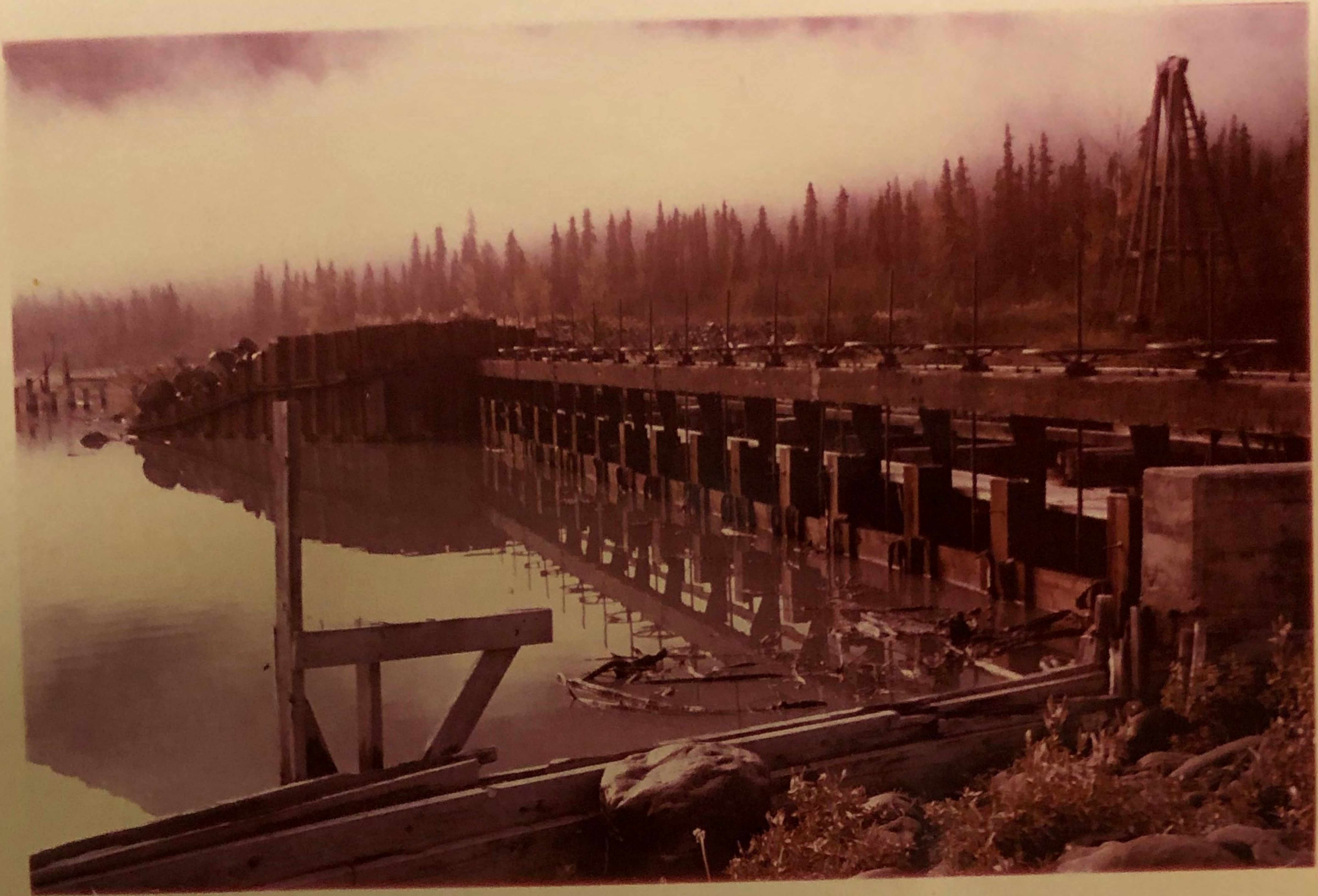
P783-908-2204 - Eklutna Project, Alaska Eklutna Dam gate structure showing lake level.