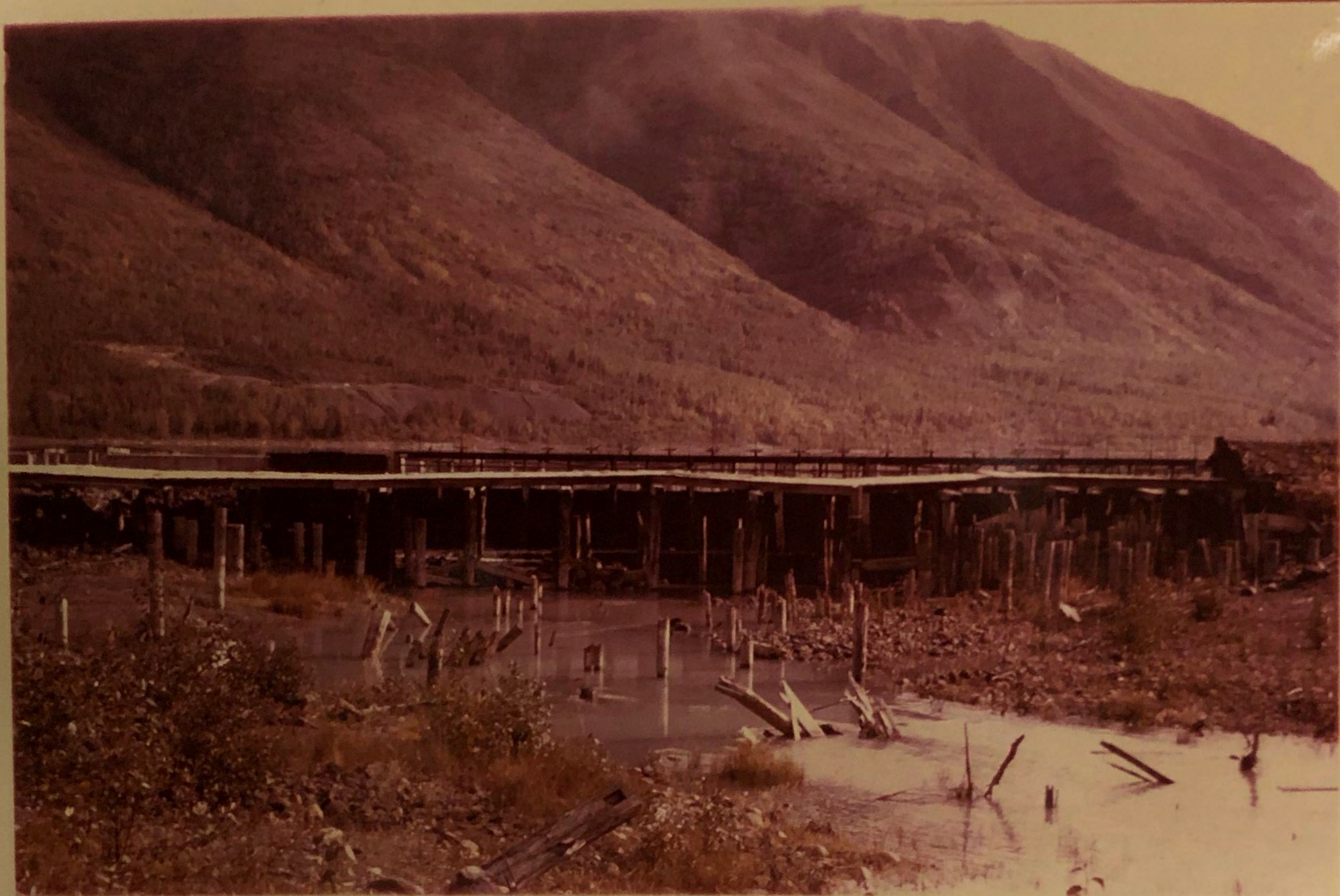
P783-908-2198 - Eklutna Project, Alaska View of Eklutna Dam showing leakage flow below dam. 9/63